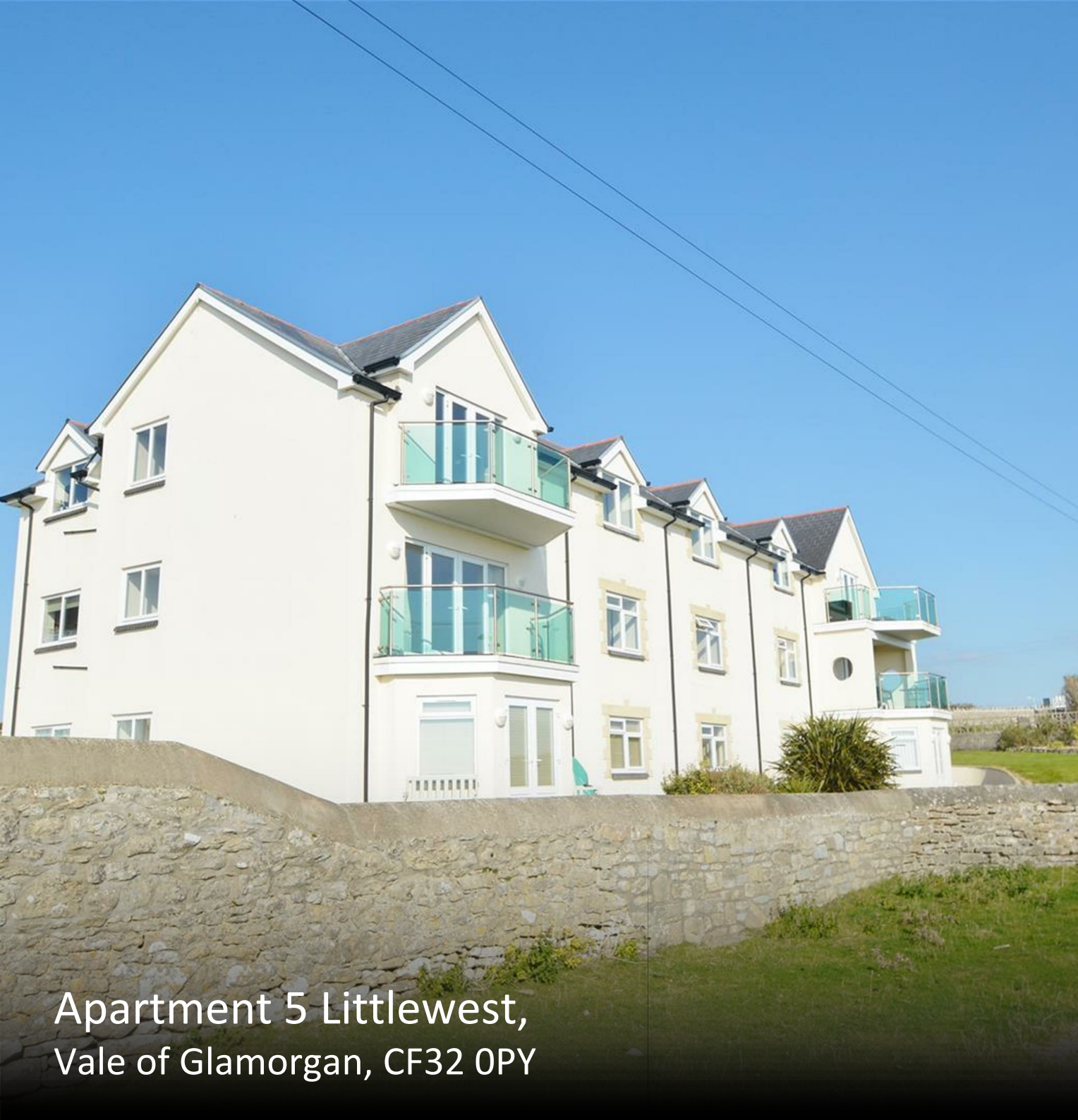
Apartment 5 Littlewest, Vale of Glamorgan, CF32 0PY